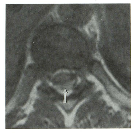
Fig. 3.—Case 3: 13-year-old girl after resection of fourth ventricular choroid plexus papilloma. Axial contrast-enhanced T1-weighted SE image (20/500) at level of thoracic kyphosis 3 days after surgery shows dependent CSF hyperintensity (arrow)

C and D, Sagittal (C) and axial (D) contrastenhanced T1-weighted SE images (20/500) 13 days after surgery reveal resolution of the CSF hyperintensity, similar to Figs. 1C and 1D.