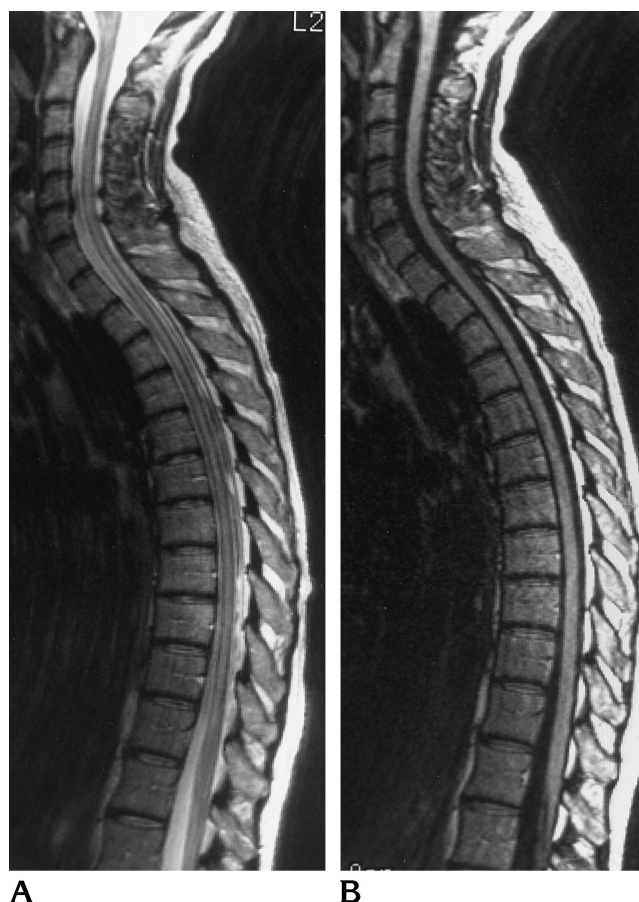
Fig 1. A 48-year-old woman with known MS lesion of the spinal cord.

In all patients, the fast FLAIR sequence was effective in nulling CSF signal in the central spinal canal, thereby substantially reducing pulsation and truncation artifacts. CSF nulling was