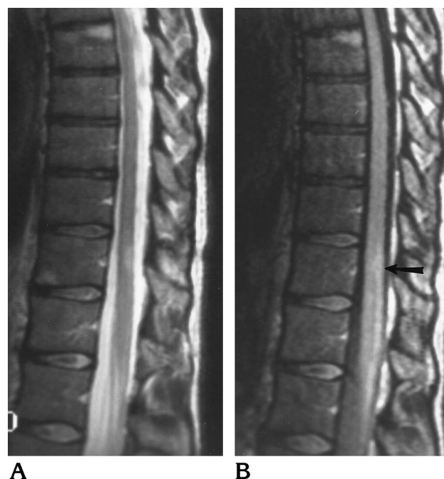
Fig 3. A 32-year-old woman with known MS lesions of the lower thoracic cord. Sagittal 3-mm fast spin-echo (2700/85/1) (A) and fast FLAIR (8000/102/1, TI of 2600) (B) images. The thoracic cord lesion is well seen on the conventional T2-weighted image, whereas only a suggestion of abnormal signal is seen on the FLAIR image in this location (arrow).

Comparison was made between the optimized TR/TI (8000–9000/2400–2600) fast FLAIR sequence and the fast spin-echo sequences. Among the five subjects imaged, 11 lesions were seen on the fast spin-echo sequences. All three observers agreed that three of the 11 lesions were not seen on the FLAIR images and that four of the 11 were less conspicuous on the FLAIR images (Fig 3). Finally, four of the 11 lesions were seen either equally or