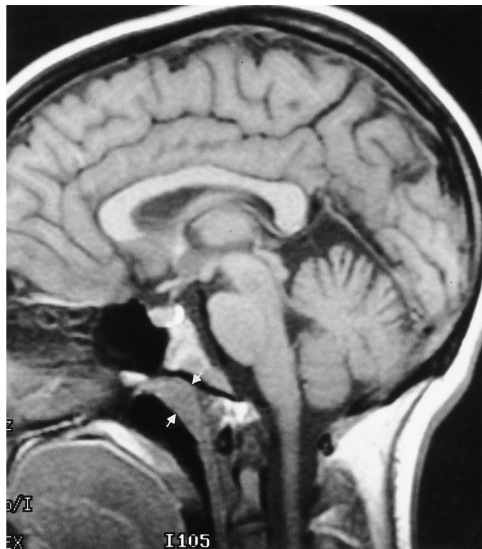
Fig 1. Sagittal T1-weighted MR image shows the technique used to measure maximum adenoidal width perpendicular to the skull base (between arrows). In some cases the measurement was anteroposterior in direction, depending on the configuration of the adenoidal tissue.

The sagittal T1-weighted (500–600/11–17/1 [repetition time/echo time/excitations], 256 \times 192 matrix, 24-cm field of view) MR images of the 42 subjects were reviewed blindly and independently by two neuroradiologists. The readers measured the maximal dimension of the nasopharyngeal lymphoid tissue at a plane roughly perpendicular to the skull base using the scales provided with the images (Fig 1). Measurements were rounded to the nearest millimeter. The mean value of the two neuroradiologists' measurements was correlated with patients' age and HIV status. MR images from an additional group of HIV-positive patients ( n = 26 ) obtained between February 1991 and April 1992 were evaluated in an identical manner and were combined with the first set to assess the relationship between nasopharyngeal width and CD4 count, hematocrit, and white blood cell count at the time the MR examination was performed. Fifty-six MR studies were performed in the 47 HIV-positive persons (21 from the 1995–96 group and the 26 additional patients). A hematologic study including either a hematocrit ( n = 56 ), white blood cell count ( n = 52 ), or CD4 count ( n = 21 ) was performed within 3 weeks before or after the MR examination in every patient.