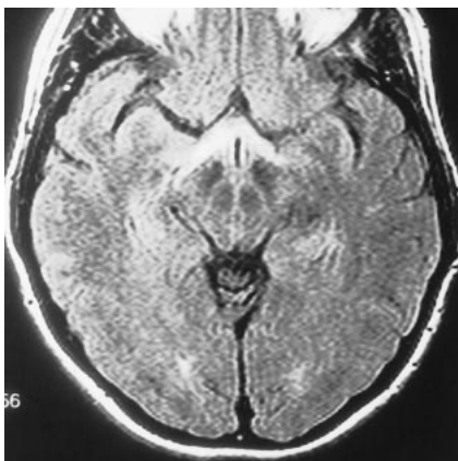
FIG 3. Increased signal in the optic tracts bilaterally is noted on this axial FLAIR image (6000/128/1, TI = 2000).

Vascular endothelial growth factor (VEGF) and vascular permeability factor (VPF) may also play a role in peritumoral edema (6, 7). It has been shown that activation of receptors for VEGF/VPF increases permeability of endothelial cells. Meningiomas with a large amount of peritumoral edema have elevated expression of VEGF/VPF. Other researchers have found that platelet activating factor (PAF), which may arise from infiltrating leukocytes, is important to the development of peritumoral edema in patients with meningioma (8). A significant positive correlation was found between peritumoral edema and PAF concentration. It has also been hypothesized that prostaglandin may play a role in the formation of edema (9). Levels of 6-ketoprostaglandin F_{1\alpha} , the stable metabolite of prostacyclin, were found to correlate well with the extent of edema.