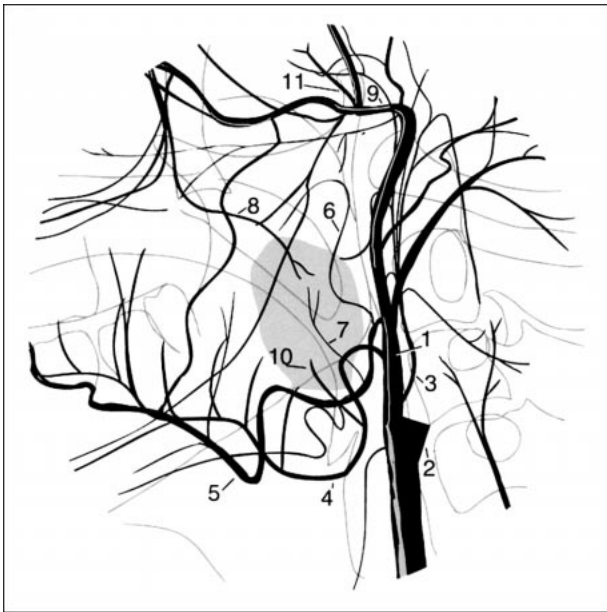
FIG 3. Drawing shows major arterial supply to the palatine tonsil and adenoidal area. 1, ECA; 2, ICA; 3, ascending pharyngeal artery; 4, lingual artery; 5, facial artery; 6, ascending palatine artery; 7, tonsillar artery; 8, descending palatine artery; 9, internal maxillary artery; 10, dorsal lingual artery; 11, accessory meningeal artery.

to surgical technique (2). Our patient with secondary PTAH presented to our hospital 14 days postoperatively. A number of factors have been suggested as increasing the risk of secondary PTAH, including elevated postoperative mean arterial pressure, excessive intraoperative blood loss, older age, a history of chronic tonsillitis, and use of nonsteroidal anti-inflammatory drugs (4, 10).