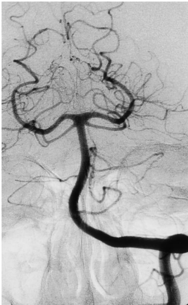
FIG 3. Follow-up angiogram obtained 6 months after stent placement shows an absence of filling of the aneurysm, normal patency of the VA and BA, and no evidence of intimal hyperplasia or concomitant vessel stenosis.

dovascular treatment in some clinical situations (eg, small curvature of the cerebral vasculature, absence of side branches on the stented segment or the possibility to sacrifice them). Future technical developments will likely improve stent-graft design and offer more sophisticated delivery systems. The long-term follow-up results of stent-graft placement, especially in cerebral vessels, are still unknown and should be studied in clinical trials.