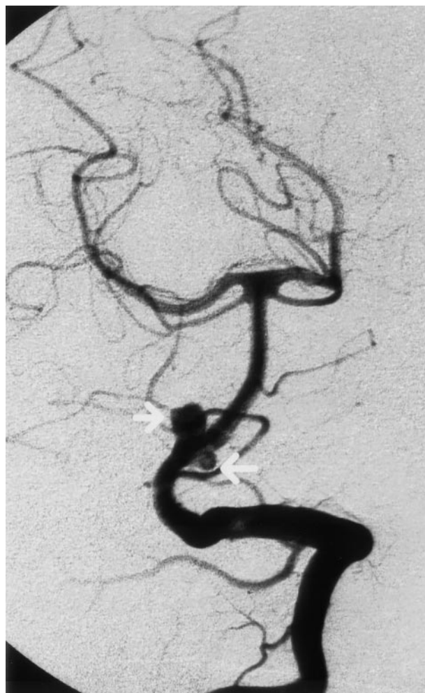
FIG 1. Initial DSA with left VA injection shows the wide-necked, irregularly shaped aneurysm of the vertebrobasilar junction (arrows)

venously), and intermittent doses of heparin were given throughout the procedure. A 7F, 90-cm guiding catheter (Vista Brite Tip Multipurpose; Cordis Europa N.V., Roden, the Netherlands) was positioned in the distal left VA. An 0.014-in microguidewire (ATW; Cordis) was passed into the left posterior cerebral artery as distally as possible to provide support. A 12 × 4-mm stent-graft (Jostent Coronary Stent Graft Supreme System with JET coating; Jomed. Unterschleibheim, Germany) was passed over the microguidewire and carefully positioned at the level of the aneurysm, distal to the origin of the left PICA and proximal to the origins of both anterior inferior cerebellar arteries. The stent-graft was then deployed across the neck of the aneurysm and the vertebrobasilar junction (Fig 2A). This system consisted of a premounted stent made of ultrathin (75 \mu m) polytetrafluoroethylene (PTFE) graft material layered be-