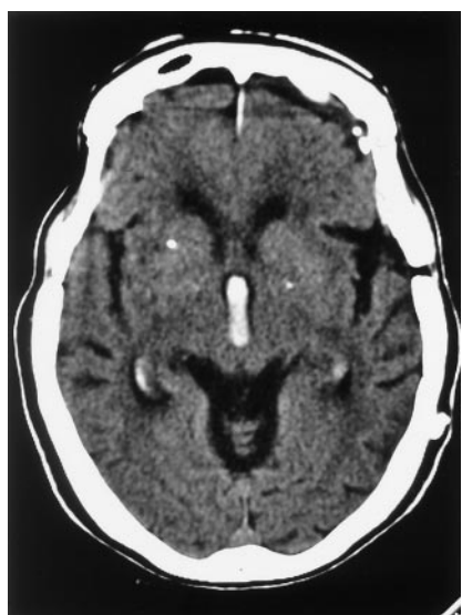
FIG 2. CT scan showing an intraventricular hemorrhage.