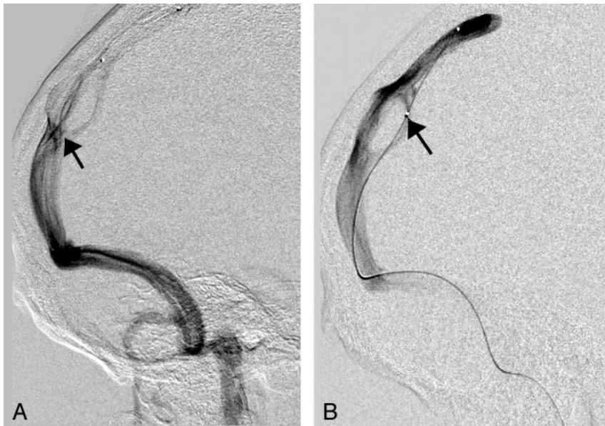
Fig 2. A, Angiogram shows the superior sagittal sinus (arrow) dividing into 3 separate channels that flow around the filling defect and reconstitute distally. B, Angiogram of the superior sagittal sinus shows a microcatheter (arrow) traversing through the right venous channel to measure pressure across the lesion within the right venous channel.