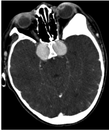
Fig 1. CT postcontrast, part of CTA, demonstrates bilateral marked enlargement of the bilateral cavernous internal carotid arteries.