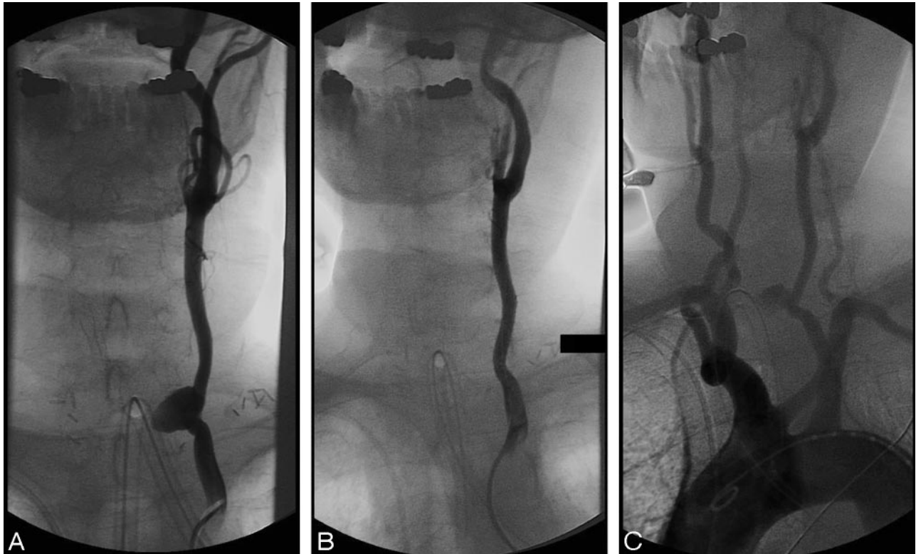
Fig 1. An 81-year-old man (patient No. 5) with metastatic thyroid cancer, treated with radiation therapy, presented with bleeding from his tracheostomy. A , A left CCA angiogram demonstrates a large pseudoaneurysm at the tracheostomy. B , Following placement of a covered stent (Fluency, 8 × 40 mm), there is exclusion of the pseudoaneurysm. C , An aortic arch angiogram demonstrates no evidence of atherosclerotic disease.