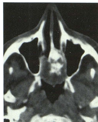
Fig. 2.—Case 2. Axial scan. Mass involves posterior nasal cavity and nasopharynx, with intratumoral calcifications and expansion of bony walls.

metastasis, then chondrosarcoma—despite its rarity—should be strongly considered as the diagnosis.