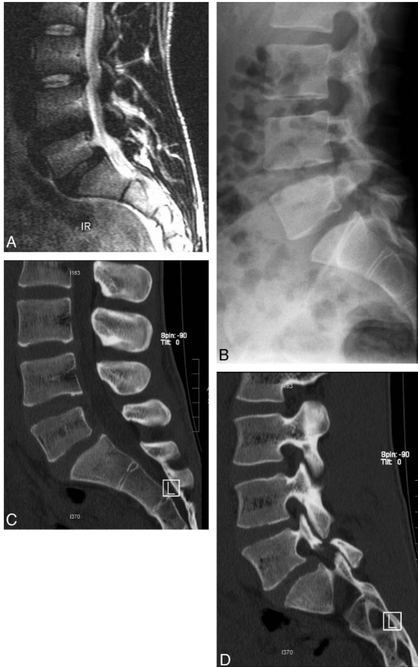
Fig 3. Hypoplasia of vertebral body and facet joint at L5. Correlation with conventional radiographs and CT scan. A , Midsagittal T2-weighted spin-echo image. Reduced anteroposterior diameter of L5 with posterior wedging. Minimal anterolisthesis L5 on S1. The intervertebral disk at L4-L5 is dehydrated. The intervertebral disk at L5-S1 is normal. B , Conventional radiographs. Confirmation of the L5 hypoplasia and the isthmolysis. C , Spiral CT scan, midsagittal reconstruction. Confirmation of the L5 hypoplasia. D , Spiral CT scan, lateral reconstruction. Notice isthmolysis at L5. The facet joint at L5 is clearly hypoplastic.

pared the different measured parameters between the patients with L5 hypoplasia and the control subjects by using an unpaired 2-tailed Student t test. P values of less than .05 were considered statistically significant.