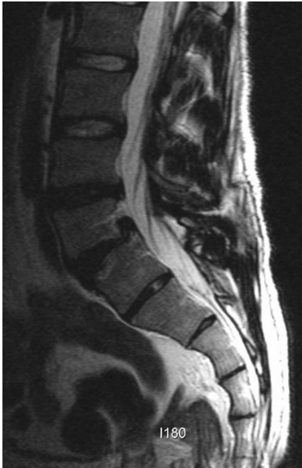
Fig 4. Hypoplasia at L5 with anterolisthesis at L5 on S1, grade I. Vertebral body at L5 is hypoplastic. There is a grade I anterior vertebral slippage. The intervertebral disks at L4-L5 and L5-S1 are dehydrated.

of L4, L5, and S1, the mean difference in anteroposterior diameter between L4 and L5 and L5 and S1, and the percentage wedging of L5 were measured.