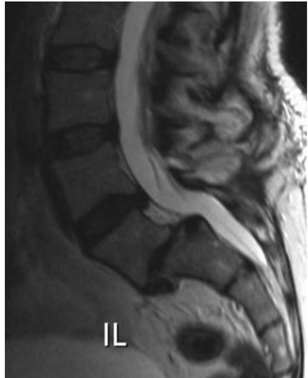
Fig 5. Hypoplasia at L5 with anterolisthesis at L5 on S1, grade II. Vertebral body at L5 is hypoplastic with considerable wedging. There is a grade II anterior vertebral slippage. Notice that the anterior displacement of the posterior border of L5 seems more pronounced than that of the anterior border because of the hypoplasia of the vertebral body. There is severe disk degeneration at L5-S1.

The results of the measurements of the difference in anteroposterior diameter between L4 and L5 and S1 and L5 in the 2 groups are summarized in Table 2. In the group of patients with hypoplasia at L5, the mean difference between the anteroposterior diameter of L4 and L5 was 3.0 mm (range, 2.2–4.1 mm) or 8.8% shortening of L5 compared with L4. The mean difference between the anteroposterior diameter of L5 and S1 was 4.4 mm (range, 4.2–4.7 mm), or 12.3% shortening