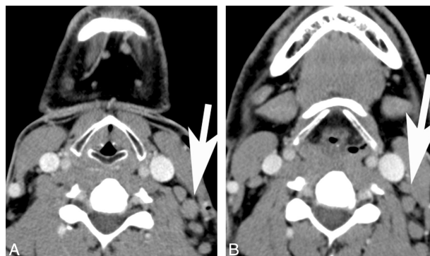
Fig 1. Contrast-enhanced CT scans at the level of the cricoid cartilage (A) and hyoid bone (B) in a 56-year-old male patient with rituximab-refractory non-Hodgkin lymphoma demonstrate enlarged level III/IV and level II lymph nodes (arrows).