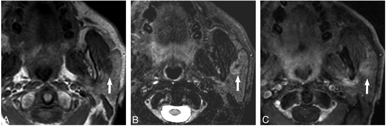
Fig 3. Case 7, 75-year-old man with history of squamous cell carcinoma of the larynx status postradiation found to have an enlarging mass in the left parotid gland on surveillance imaging. A , Axial T1-weighted MR image shows a well-demarcated mass within the superficial lobe of the left parotid gland ( white arrow ) that is T1 hypointense. B , Axial T2-weighted MR image with fat saturation shows the mass to be hyperintense but heterogeneous to the native parotid gland. C , Axial T1-weighted postgadolinium sequence shows the mass ( white arrow ) to demonstrate heterogeneous enhancement to the native parotid gland.