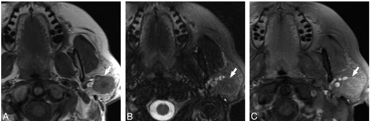
Fig 1. Case 1, 62-year-old female with 2-year history of firm, painless left parotid mass. A , Axial T1-weighted MR image shows a well-demarcated mass within the superficial lobe of the left parotid gland (white arrow) that is T1 hypointense. B , Axial T2-weighted MR image with fat saturation shows the mass (white arrow) to be isointense to the native parotid gland. C , Axial T1-weighted postgadolinium sequences illustrates the mass (white arrow) as isointense to the native parotid gland.