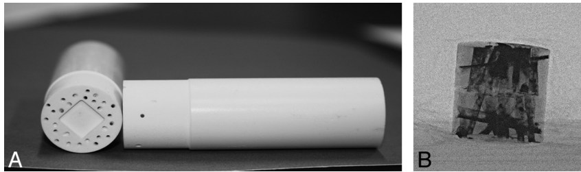
Fig 1. A, Cylindric AVM model: a plastic water phantom with a tubular perforation (model A). B, X-ray radiography of the model B showing the radiopacity of the embolic agent. The film is positioned in the center of the phantom.