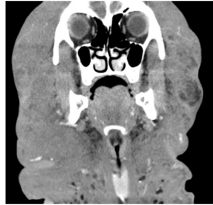
Fig 1. Diffuse subcutaneous soft tissue enlargement with a honeycomb appearance and increased vascularity in the entire head and neck, which were compatible with lymphedema due to foreign-body injection.

Attempts to rejuvenate the aging hands have recently gained popularity; with development of dermal fillers, patients have various options. 7 Recently, calcium hydroxyapatite (CaHA) fillers have been considered suitable for resurfacing the aging hand. 8–13 In 2010, Bidic