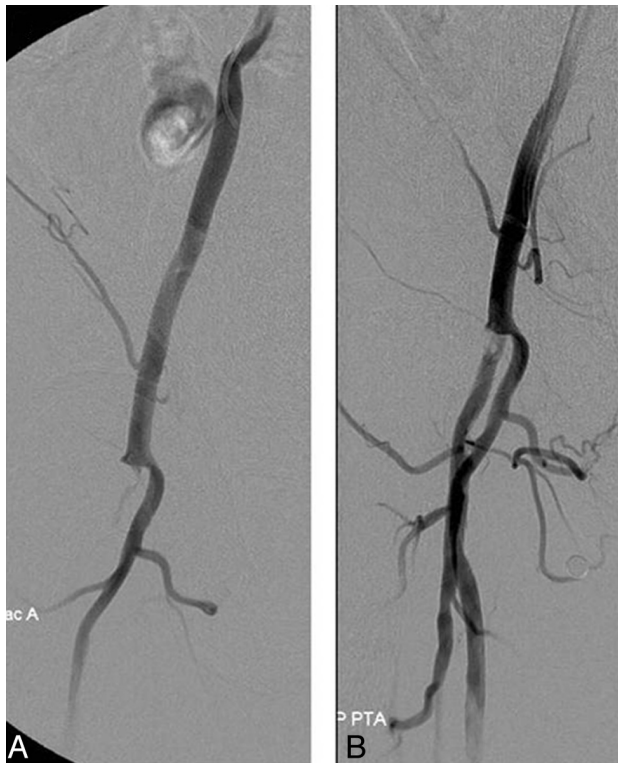
FIG 2. Right common iliac artery angiogram showing occlusion at the common femoral artery (A) and revascularization after angioplasty (B).

man had undergone carotid angioplasty and stent placement for a symptomatic high-grade stenosis of the carotid artery. No obvious local abnormality was shown on the angiogram before deployment of the closure device, but the pedal pulse was found to have diminished a few hours later. An angiogram showed an occluded common femoral artery at the puncture site. Flow was restored following balloon angioplasty (Fig 2). Anticoagulation was maintained for 24 hours, and no change in flow was apparent by sonography and during clinical follow-up. Despite the complication, there was no delay in the discharge of this patient.