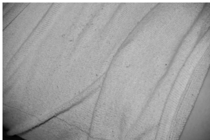
FIG 2. The patient wore a Boston Silver T shirt beneath a conventional cotton tee shirt during her imaging study. It was not until after the scan that it was realized that the undershirt, recommended for wear beneath her back brace, contained antimicrobial silver microfibers.

don, Pennsylvania), was it determined that the shirt fabric was impregnated with SMF. On careful review of the shirt, it was noted that the midaxillary burn corresponded with the single shirt seam.