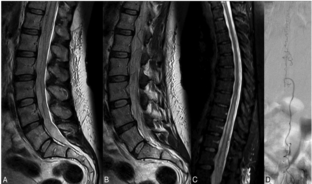
FIG 1. A 57-year-old woman with a 3-month history of bilateral lower extremity tingling and progressive lower extremity weakness. A and B , T2-weighted lumbar spine MR images demonstrate high T2 signal in the conus with multiple flow voids in the intradural space. C , T2-weighted MR image of the thoracic spine demonstrates high T2 signal in the lower thoracic cord to the conus. The patient was diagnosed with neuromyelitis optica and received no spinal-vasculature imaging before referral to our institution. Two rounds of IV methylprednisolone (Solu-Medrol) therapy resulted in worsening of symptoms, and rituximab therapy was of no benefit. D , Spinal angiography demonstrates the spinal dural AVF with an arterial feeder from the L3 radiculomeningeal artery.