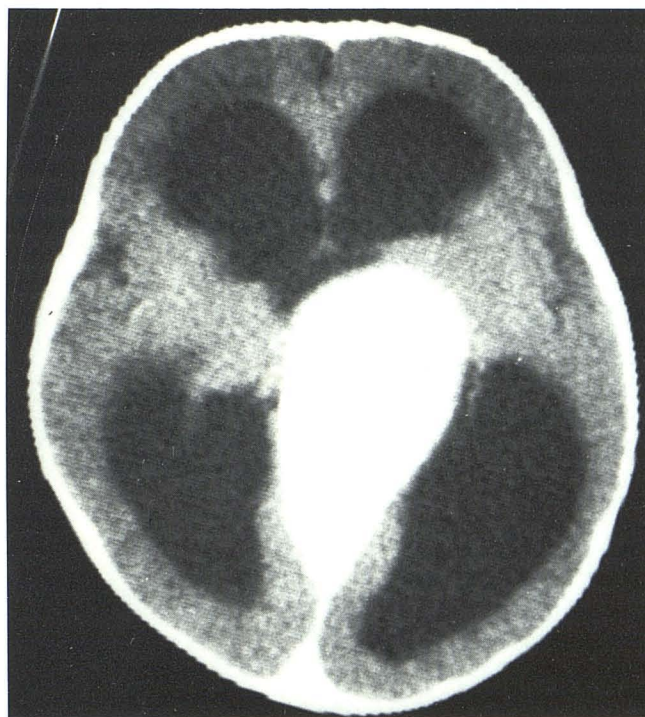
Fig. 1.—Obstructive hydrocephalus caused by large midline lesion, which was discretely hyperdense on nonenhanced CT and showed intensive enhancement after IV contrast injection.

MRI was diagnostic of Galenic vein aneurysm in our case. The jetlike arterial filling of the aneurysm with turbulence and the relative stasis of blood within other parts of the malfor-