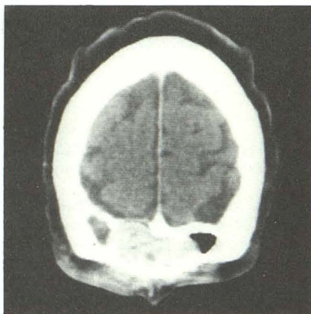
Fig. 1.—Patient 6. Coronal postcontrast CT scan shows enhancing, partially expansile and partially destructive frontal sinus mass.

Note.—DOD = died of disease; NED = no evidence of disease.