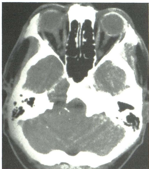
Fig. 3. —Case 3: Axial CT scan of skull base at bone window settings demonstrates a lytic lesion in right petrous apex with foci of calcification in associated soft-tissue mass extending into posterior cranial fossa.

occur over a wide age range but most commonly in the fourth or fifth decade and are approximately twice as common in males as females [8]. Macroscopically, a chordoma is usually a lobulated soft gelatinous tumor that destroys bone. It commonly calcifies and may show areas of hemorrhage and necrosis. Microscopically, there are cords of cells that have a syncytial appearance. Some cells may have a large vacuolated cytoplasm and are called physaliphorous cells. There is usually extensive stroma containing mainly mucin. The intra-