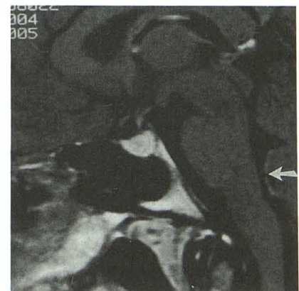
Fig. 3.—Sagittal T1-weighted MR image, SE 600/20, obtained after administration of contrast material shows enhancement in choroid plexus (arrow) just ventral to inferior medullary velum, separate from region of area postrema as seen in Fig. 1B.