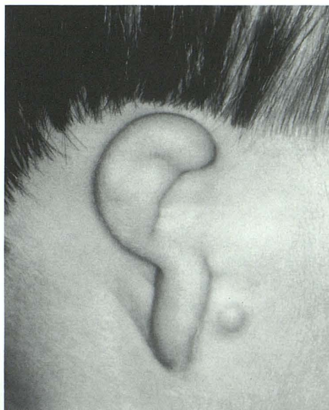
Fig. 3. Grade III microtia.

We have developed a rating scheme based on the CT scan to grade the candidacy of our patients for surgery. The scale is based on a best possible score of 10 (Table 1). In the grading scheme, the stapes is assigned 2 points, since