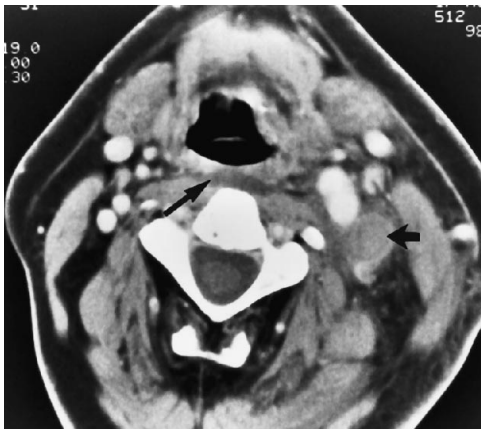
Fig 3. 55-year-old man with Hodgkin disease 5 weeks after placement of deep venous catheter for chemotherapy. Only a small amount of edema is revealed in the retropharyngeal space ( long arrow ). Left internal jugular vein thrombosis ( short arrow ).

Since being described by Patel and Brennan (1), the findings in this abnormality have been refined to include the presence of edema or