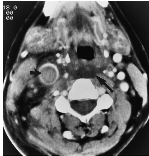
Fig 4. 60-year-old woman who presented with neck swelling 2 weeks after indwelling catheter placement. The right internal jugular vein is thrombosed and enlarged ( short arrow ). Masslike edema is in the retropharyngeal space ( long arrow ). In all patients, edema in the retropharyngeal space was not readily observable below the level of the cricoid cartilage.

inflammation in the soft tissues of the neck, which on CT are manifest most commonly as a haziness in the deep fat of the prestyloid and retrostyloid parapharyngeal spaces to the level of the hyoid bone and the carotid space below the hyoid bone (1-4). We describe four patients with acute internal jugular vein thrombosis who had edema in the retropharyngeal space that created a convex bulge to the anterior border of the space simulating a hypodense mass on CT. The focal edema present within the retropharyngeal space of all four of our patients had a masslike quality that could mimic an abscess (or cellulitis) in the proper clinical setting. This was particularly true in our first case, where clinical worsening precipitated surgery, in which an abscess was not found. It is perplexing that no infection could be definitely documented in this patient, even within the vein thrombus, which should have been theoretically "isolated" from the antibiotics that had just been initiated. Signs of internal jugular vein thrombosis and infection can overlap, especially in children. This is succinctly illustrated in case 2, in which symptoms practically resolved within 12 hours, much too early for resolution of a neck fasciitis.