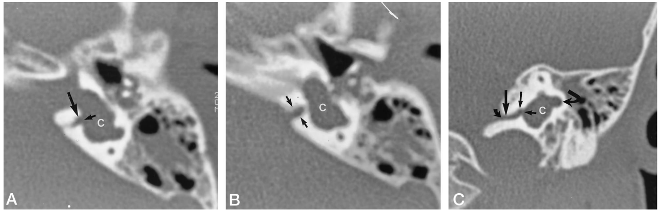
FIG 1. CT findings of enlarged cochlear aqueduct in an 18-month-old boy.

A, Axial scan obtained through the temporal bone shows dilatation of the lateral orifice ( small arrow ) and otic segment ( large arrow ) of the cochlear aqueduct. Note the associated common cavity malformation (C) of the inner ear. On otoscopic examination, the soft-tissue attenuation surrounding the ossicles was thought to represent fluid in the middle ear cavity rather than cholesteatoma.