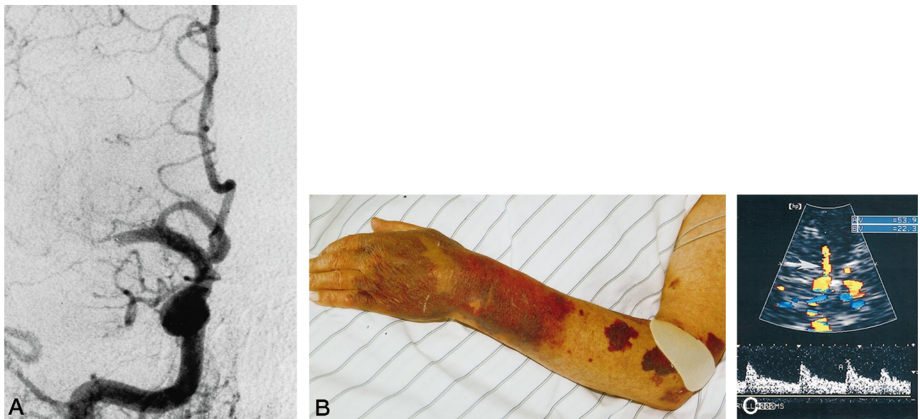
FIG 1. A, Angiogram shows occlusion of the right MCA main stem 90 minutes after stroke onset. B, Photograph shows subcutaneous ecchymosis during thrombolysis at a dose of 40 mg alteplase. C, Axial TCCS view shows the circle of Willis and recanalization of the MCA (arrow). Doppler spectrum obtained from the MCA segment shows no abnormalities (flow velocity: systole 54 m/s, diastole 22 m/s).