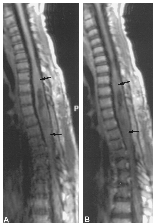
FIG 4. 6-year-old boy with a thoracic ganglioglioma and scoliosis, who had undergone a diagnostic spinal cord biopsy before imaging.

Focal enhancement was identified more frequently in the spinal ependymoma group, in which 65% demonstrated focal enhancement as compared with 19% of spinal gangliogliomas (Fig 3). Diffuse enhancement was noted more frequently in the spinal astrocytoma group. Seventy-nine percent of spinal astrocytomas showed diffuse enhancement, while only one spinal ganglioglioma in our series showed diffuse enhancement. Patchy enhancement was seen in 65% of spinal gangliogliomas (Figs 1 and 2). Enhancement reaching the surface of the cord was seen in 58% of cases of spinal ganglioglioma (Figs 1 and 3). Both these types of enhancement were present only in the ganglioglioma subgroup without exception (Table 1). These figures were statistically significant ( P < .001 ). Finally, 15% of spinal gangliogliomas showed no type of contrast enhancement (Fig 4); this was not statistically significant.