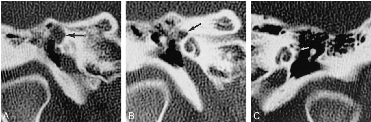
FIG 1. A–C, 34-year-old man with three episodes of meningitis over the course of 1 year. High-resolution coronal temporal bone CT scans of the right ear show smooth enlargement of the right geniculate fossa (arrow, A) and of the labyrinthine facial nerve canal (arrow, B), and a normal labyrinthine facial nerve canal of the left ear (arrow, C).