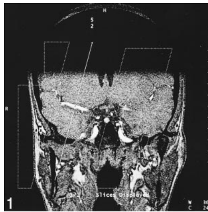
FIG 2. Coronal-plane MR image (patient 5), chosen to localize the M1 segment and the optimal MCA cross-section plane.