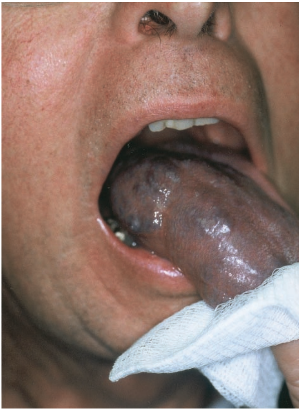
FIG 1. Image of a 42-year-old man with extensive venous malformation of the tongue.

formed with the patient under conscious sedation using midazolam (Versed; Roche Laboratories, Nutley, NJ) and fentanyl (Abbott Laboratories, North Chicago, IL).