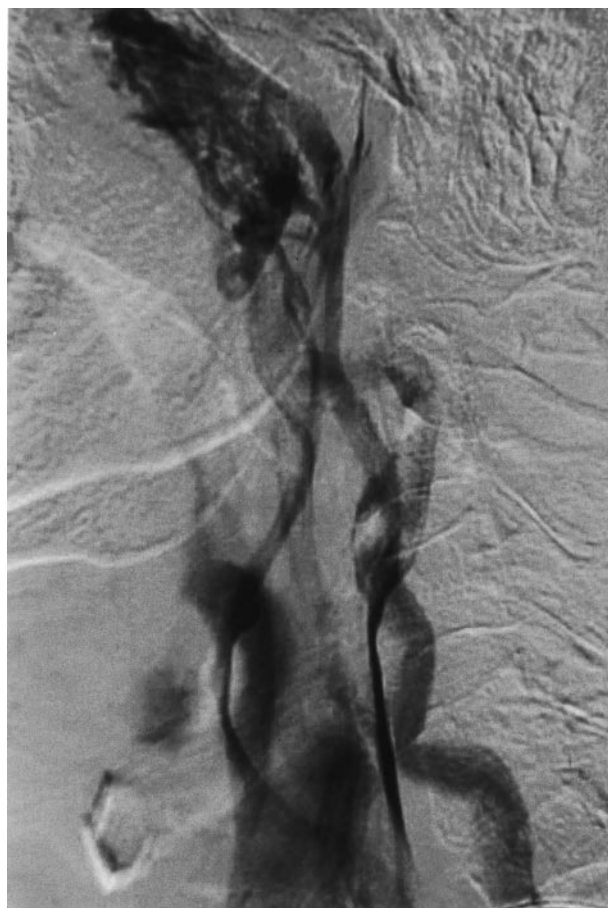
FIG 2. Venous-phase angiogram shows the pterygoid plexus, maxillary veins, facial vein, and retromandibular-external jugular vein channels.

Although transarterial detachable balloon occlusion may be a quick, efficient, and safe method for occluding most direct carotid cavernous fistulas and although it remains the preferred treatment of choice to close direct carotid cavernous fistulas, it is not without complexities, limitations, and complications. The transvenous access to the cavernous sinus offers an alternative route and has supplanted transarterial embolization of dural feeders originating from the external carotid artery or the ICA, for indirect (or dural) arteriovenous fistulas of the cavernous sinus (dural carotid cavernous fistulas). Transvenous embolization for direct carotid cavernous fistulas has been primarily used in cases in which transarterial access has been impossible because of unfavorable position or size of the ostium of the fistula or unfavorable slow-flow characteristics of the fistula, both of which imply unfavorable mechanical characteristics of