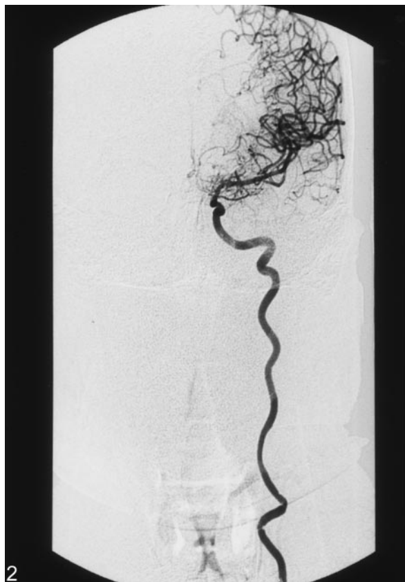
FIG 2. Anteroposterior (AP) view of the nonbranching ICA.