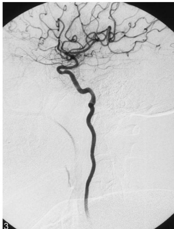
FIG 3. Lateral view of the nonbranching left ICA.