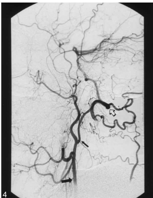
FIG 4. Lateral view of left the ECA ( bottom solid arrow ), type II proatlantal intersegmental artery ( top solid arrow ), and vertebral artery ( open arrow ).