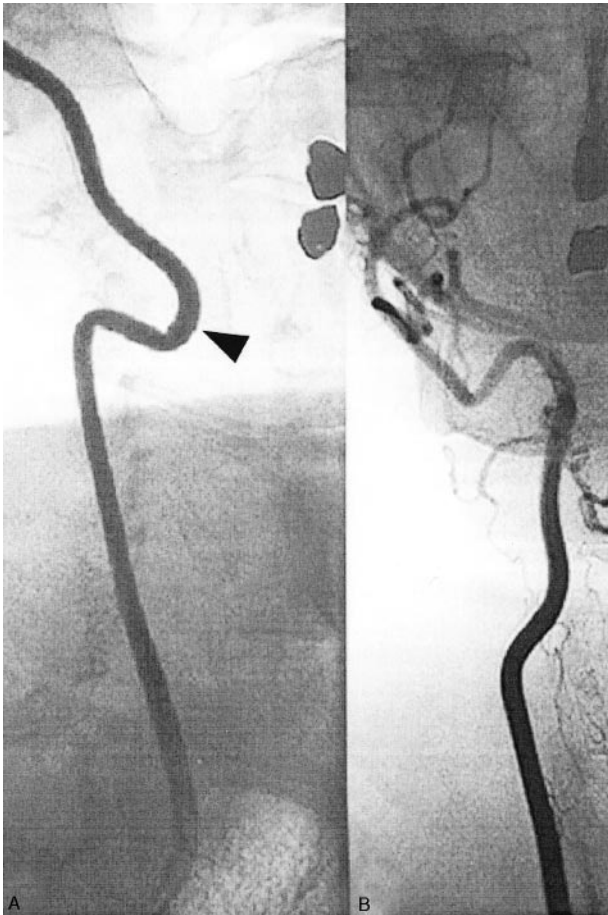
FIG 2. Frontal view digital subtraction angiogram.

A, Course of the right ICA in the neck. Note the tortuosity at the C3-C4 level (arrowhead).