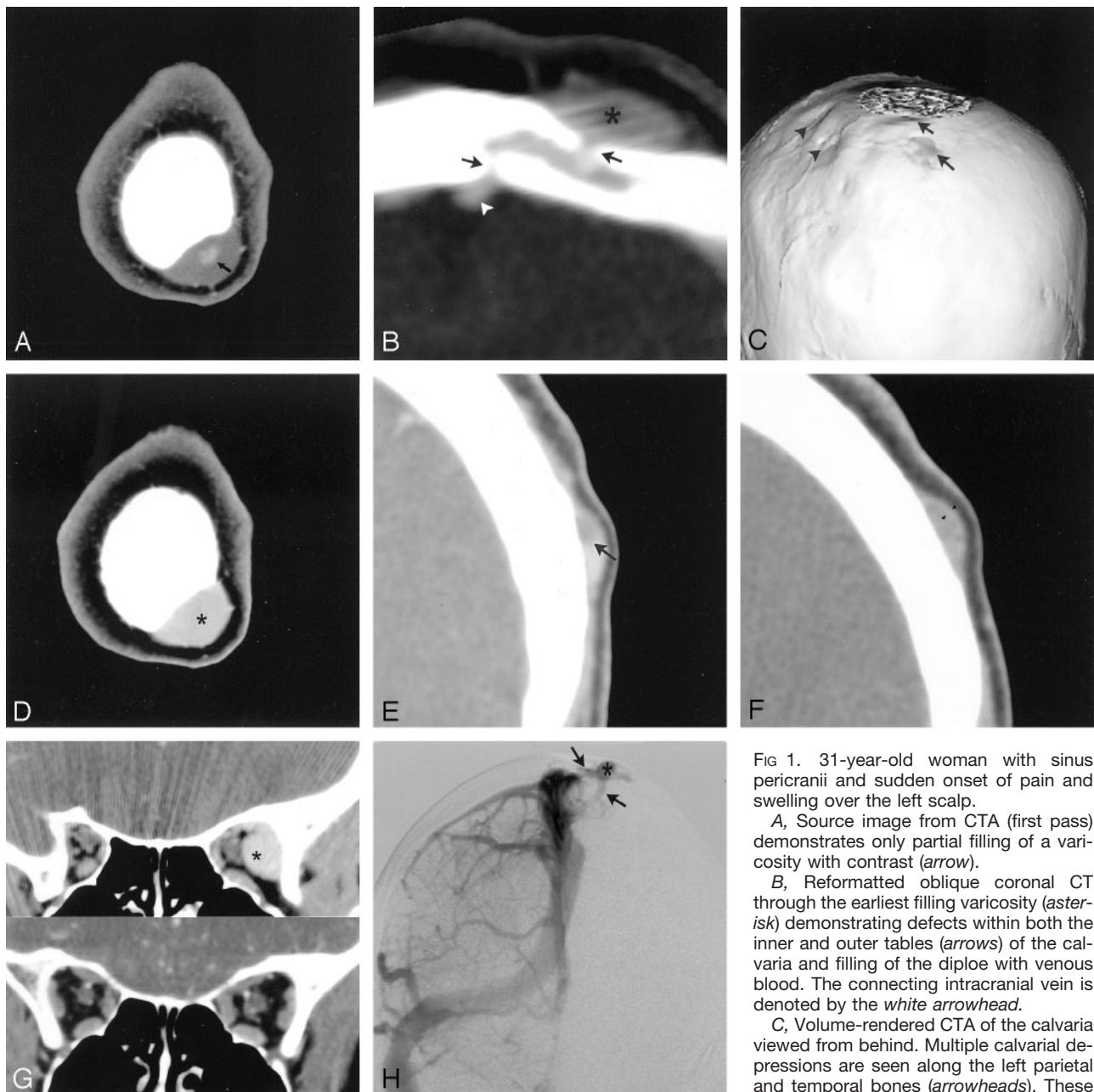
FIG 1. 31-year-old woman with sinus pericranii and sudden onset of pain and swelling over the left scalp.

A, Source image from CTA (first pass) demonstrates only partial filling of a varicosity with contrast (arrow).