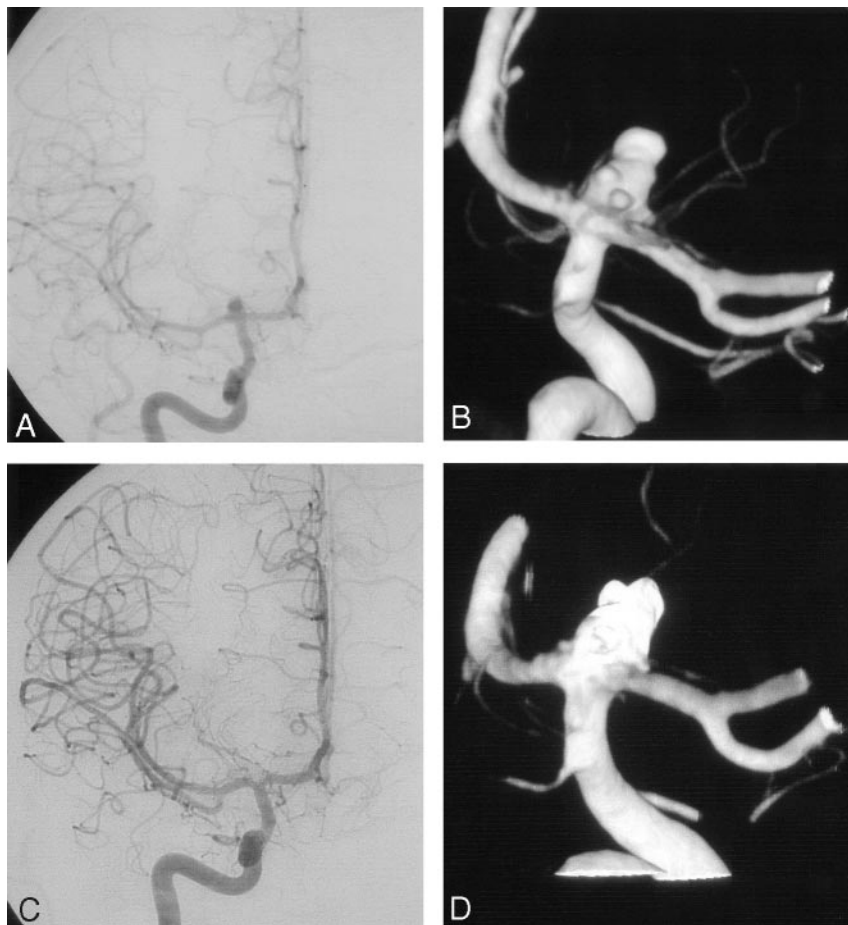
FIG 3. SAH in a 33-year-old woman.

A and B, Conventional (A) and 3D (B) angiograms of the right ICA obtained before treatment show an ICA bifurcation aneurysm with multiple daughter sacs.