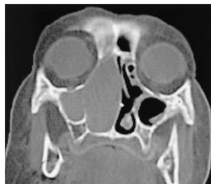
FIG 1. Noncontrast coronal CT scan shows a low-attenuated mass in the right nasal cavity without apparent erosion of the bone.

A biopsy was performed, and the pathology report was consistent with hemangioma. Macroscopic examination at the time of surgery revealed a smooth mass arising from the nasal septum. The lesion was removed at our hospital, and the