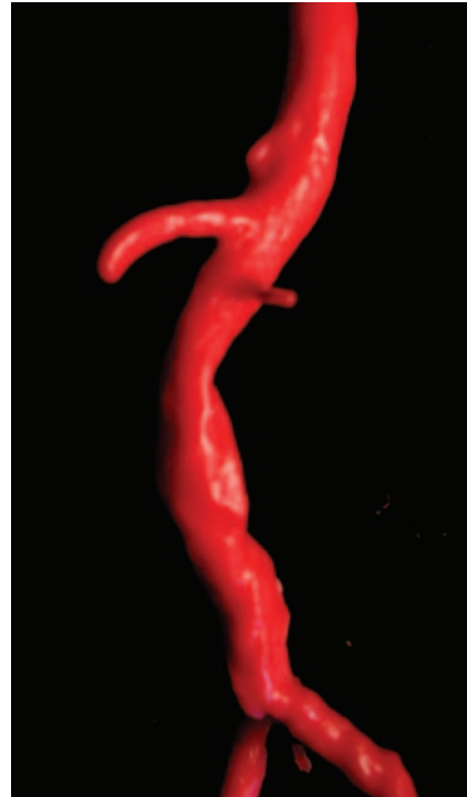
FIG 6. Molded wax replica created from his CT angiographic data.

study the live patient has required, first, access to the advanced imaging capability now routinely found in most departments with the CT scanner and its angiography algorithm and, second, the combination of locally developed and proprietary computer algorithms