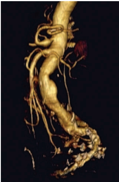
FIG 5. CT angiogram reconstructed on the Vitrea workstation shows the abdominal aortic aneurysm in patient 3.

study the live patient has required, first, access to the advanced imaging capability now routinely found in most departments with the CT scanner and its angiography algorithm and, second, the combination of locally developed and proprietary computer algorithms