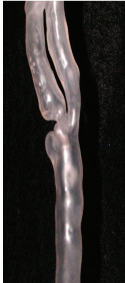
FIG 3. Silicon replica made by the lost-wax technique. This replica was then used to study the flow dynamics of this patient by placing it in a neck phantom and perfusing non-Newtonian fluids while injecting isobaric dyes into the slipstreams (not shown here). The replica was next placed into the scanner, the fluid in the phantom was made isoattenuated to the silicon with contrast agent, and the entire phantom was scanned by using the same scan parameters as were used to scan the patient.

dicular to the long axis of the vessel at the point of measurement.