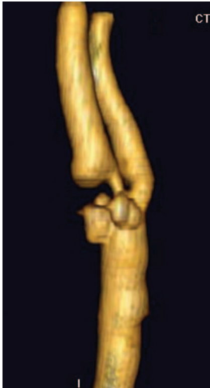
FIG 1. Patient 1. Vitrea workstation reconstruction of right common carotid bifurcation. The high-grade stenosis and multiple proximal complex ulcerations in the bulb are evident.