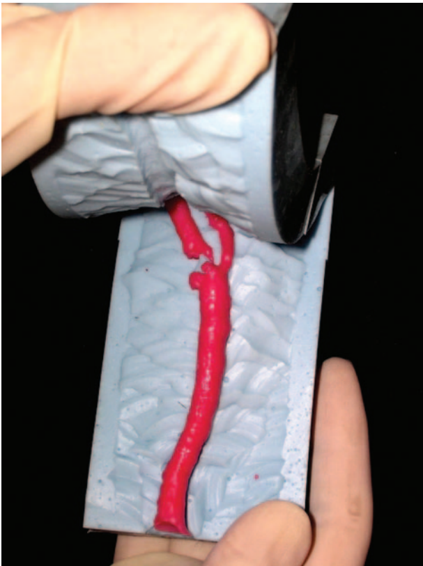
FIG 2. After reconstruction of the study segment on the Z Corporation RP machine, the plaster-like reproduction of the vessel lumen was used to make a master mold. Here the mold has been opened, revealing the wax model that reproduces the complex configuration and size of the original.