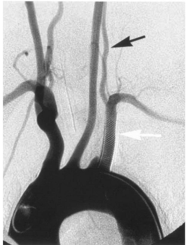
FIG 5. Arteriogram of the aortic arch after stent placement (white arrow) shows the recanalized left subclavian artery and the antegrade flow in the left vertebral artery (black arrow).

The endovascular treatment was performed with antiplatelet therapy and full heparinization, while the reversed flow in the left vertebral artery protected the vertebrobasilar system from thromboembolic complication. At the end of the procedure, the left subclavian artery was fully recanalized and the anastomoses