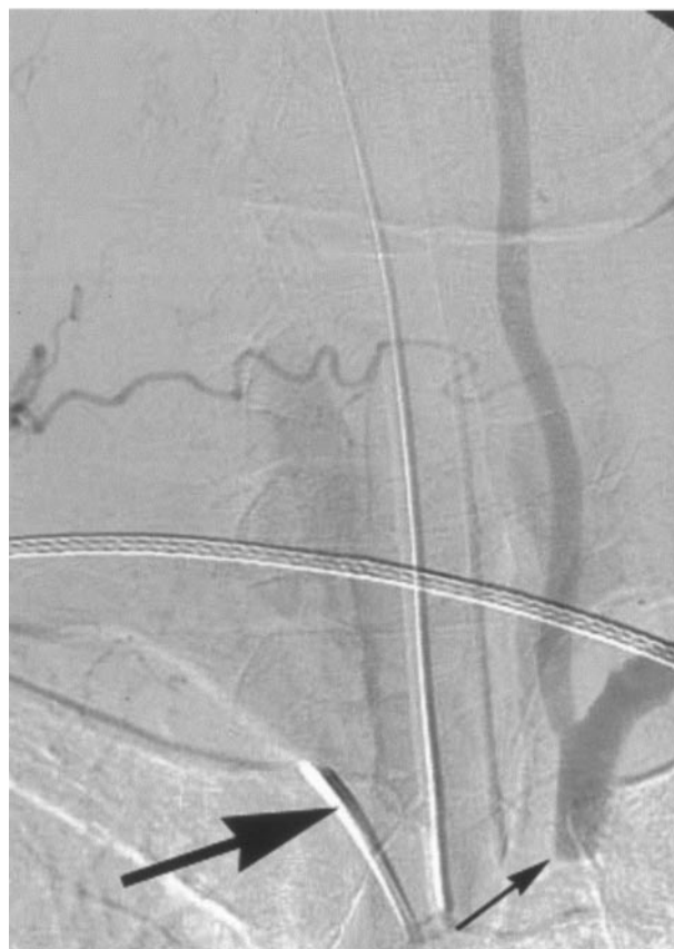
FIG 1. Selective arteriogram of the right subclavian artery (large arrow, catheter placed in this vessel), anteroposterior view, late phase, shows reversed flow in the left vertebral artery and the occluded proximal left subclavian artery (small arrow) as well as antegrade filling of the distal left subclavian artery.

A 65-year-old woman had a pulsatile tinnitus on the left side, which had started 1 year earlier. The patient had a left subclavian artery occlusion diagnosed 3 years earlier when moving the left arm started causing vertigo. Aspirin therapy, 160 mg daily, was then initiated. The auscultation revealed a murmur in the left retroauricular region, which did not change during head rotation but disappeared when the left common carotid artery was compressed. MR imaging did not show any brain abnormality. To exclude a dural arteriovenous fistula on the left lateral sinus, we obtained a cerebral angiogram with the patient under general anesthesia. Both common carotid arteries and the right subclavian artery were selectively injected. The left subclavian artery was occluded above the left vertebral artery origin. The right subclavian artery injection showed a high-grade stenosis at the level of the vertebral artery origin and a delayed and reversed filling of the left vertebral and subclavian arteries. (Fig 1). Selective injection of the left external carotid and occipital arteries showed a filling of the proatlantal I and II anastomoses, providing reversed flow to the left vertebral and deep cervical arteries that supply the left arm arterial vasculature (Fig 2). Because of the clinical findings and