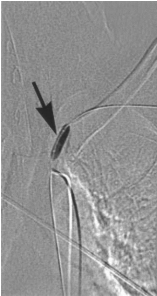
FIG 4. A blank road rap, anteroposterior view, shows the inflated percutaneous transluminal angioplasty balloon after passing the occlusion with a 0.0035-inch guidewire.

with a vertebrobasilar insufficiency (15%), both of which are present in 30% of patients (12).