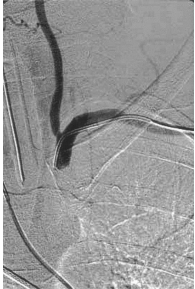
FIG 3. Selective arteriogram of the right subclavian artery, anteroposterior view, late phase, shows the 5F catheter navigated in the left subclavian artery after left transbrachial approach.

Pulsatile tinnitus, also called vibratory tinnitus, manifests as an intracranial murmur, synchronous with the heartbeat. It can become significantly disturbing for a patient, and in some cases, it may be the