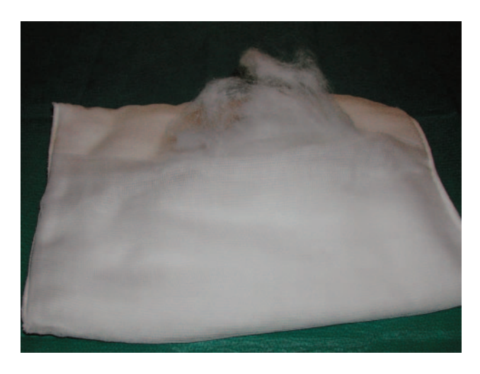
Fig 5. Unsealed gauze furnished in the vascular set. Spontaneous leakage of unattached fibers may be seen after minimal handling of the gauze.

be observed in arterial lumen of histologic specimens of tumors and arteriovenous malformations operated on after embolization. Silent thromboembolic events are frequently diagnosed on MR diffusion sequences after cerebral or cardiac angiography with an incidence ≤62%.² These lesions may be attributed to inadvertent injection of micro bubbles of air- or platelet-derived thrombi. The incidence of such lesions can be significantly reduced by using a filter placed at the proximal part of the catheter, as shown in a prospective randomized study.¹¹⁰ This kind of filter may also be used to prevent inadvertent injection of foreign material such as synthetic fibers.