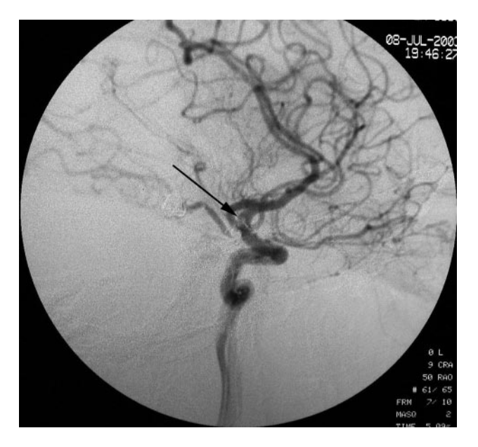
Fig 2. Immediate angiographic control after removal of the thrombus with a goose-neck microsnare. The thrombus can be seen at the level of the carotid siphon (arrow).