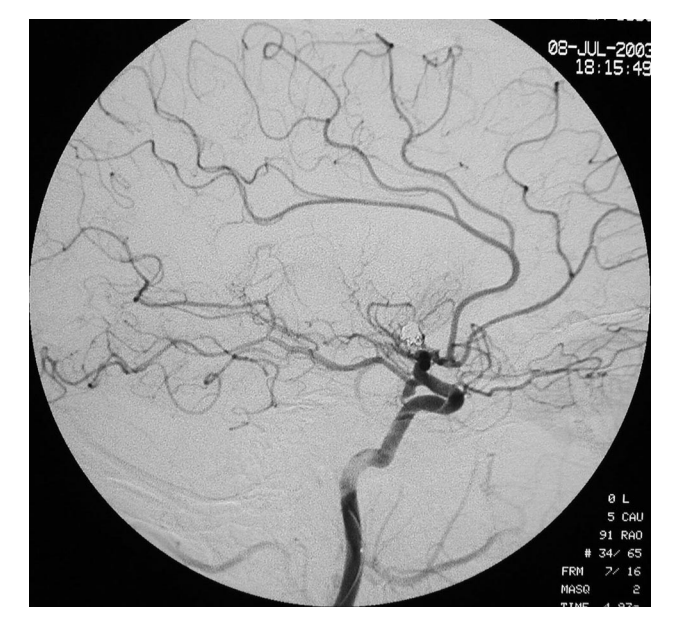
Fig 1. Lateral projection of the left internal carotid artery after insertion of the microcatheter showing an acute occlusion of the middle cerebral artery.

Address correspondence to: René Chapot, Unité de Neuroradiologie Interventionnelle, Hôpital Universitaire Dupuytren, 2 avenue Martin Luther King, 87042 Limoges, France.