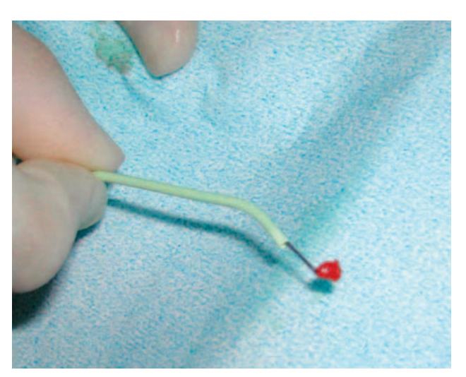
Fig 3. Removal of the thrombus that is caught in the goose-neck microsnare.

ported in the basilar artery<sup>5</sup> or a dedicated device.<sup>6,7</sup> In our patient, the goose-neck microsnare allowed rapid recanalization without thrombus fragmentation and capture of the thrombus so that further histologic analysis could be achieved and the synthetic fibers found.