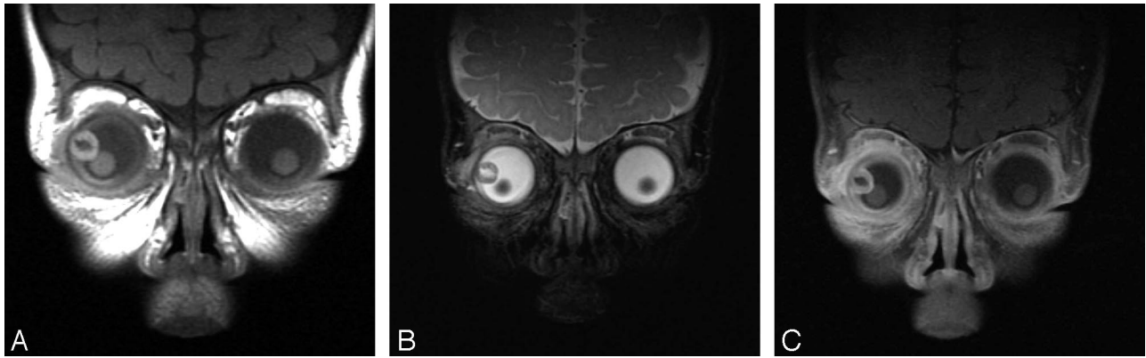
Fig 2. T1- and T2-weighted MR images revealed a circumscribed ringlike mass in superolateral aspect of right eye. The central portion of the mass was low signal intensity relative to vitreous on coronal T1WI (A) and high signal intensity on T2WI (B). The peripheral portion of mass revealed slightly high signal intensity on T1WI and low signal intensity on T2WI. Coronal gadolinium-enhanced T1WI (C) showed strong and homogenous enhancement in peripheral portion of mass in continuity with the enhancing uveal tract.