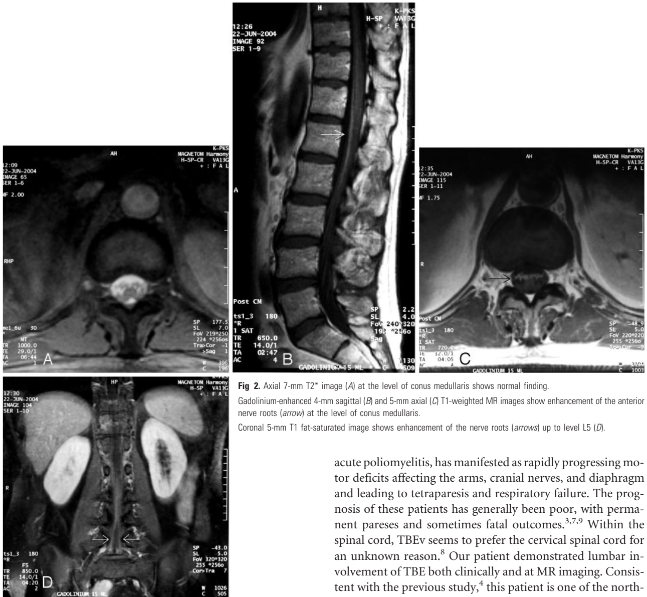
Fig 2. Axial 7-mm T2* image (A) at the level of conus medullaris shows normal finding. Gadolinium-enhanced 4-mm sagittal (B) and 5-mm axial (C) T1-weighted MR images show enhancement of the anterior nerve roots (arrow) at the level of conus medullaris. Coronal 5-mm T1 fat-saturated image shows enhancement of the nerve roots (arrows) up to level L5 (D).

research project, 184 ticks were collected from Kupu Island, and 3 of them were positive for TBEv (A. Jaaskelainen et al, unpublished data, 2005).