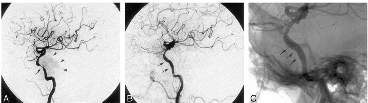
Fig 2. A, Right carotid angiogram shows a high-grade stenosis of the cavernous portion of the right internal carotid artery. B and C, Control angiograms obtained after the procedure show good position of the stent with good re-expansion of the stenosis.