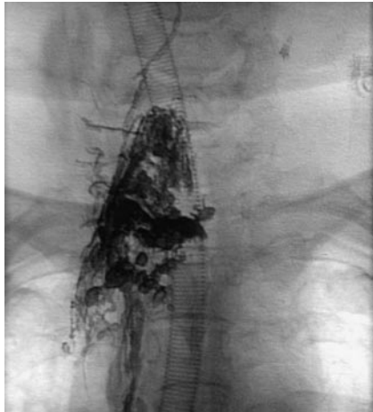
Fig 6. Final Onyx cast.

blocking of numerous small feeding arteries. Because of its epidural component, embolization of the whole tumor by direct puncture was considered too dangerous on account of the mass effect of the tumor on the spinal cord and the risk of a reflux of Onyx into the spinal arteries.