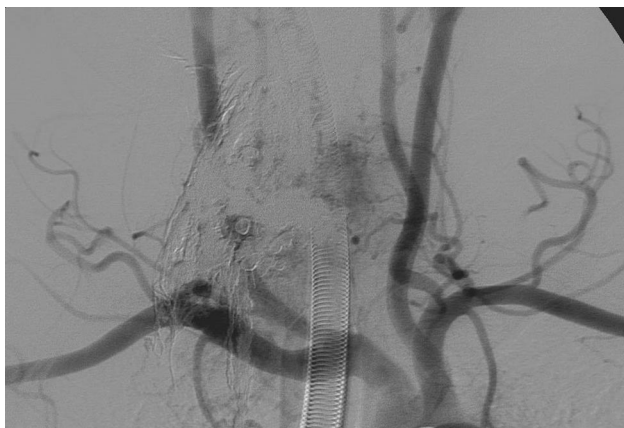
Fig 5. Aortic arch injection—final control showing a small residual blush.

feeding branches, involvement of branches arising from the internal carotid and vertebral arteries, and possible vasospasm. 8 One of the main advantages of intratumoral injection is easier access to the vascular tumor bed, which is not limited by arterial tortuosities, atherosclerotic disease, or induced vasospasm. However, this does not fully overcome