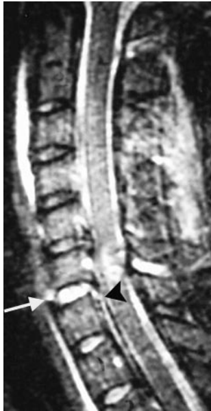
Fig 1. True-positive injuries to the ALL, disk, and PLL. Sagittal STIR image demonstrates disruption of the ALL (arrow), intervertebral disk, and PLL (arrowhead) at C6–7. Injuries were confirmed at surgery.