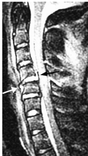
Fig 2. True-positive injuries to the ALL, disk, and PLL. Sagittal fast spin-echo T2-weighted image shows elevation of the ALL (white arrow), disruption of the intervertebral disk, and elevation of the PLL at C4–5 (black arrow). Injuries were confirmed at surgery.