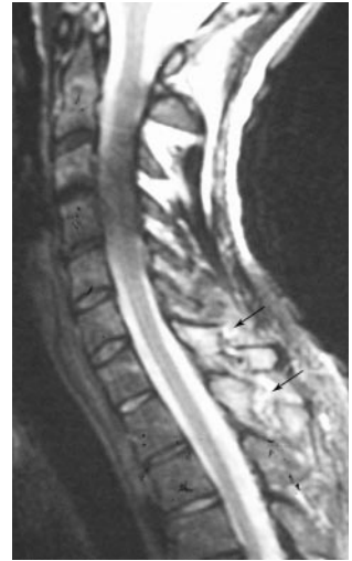
Fig 9. False-negative ligamentum flavum and true-positive interspinous soft tissue injury. Sagittal T2-weighted image shows spinous process fractures of C7 and T1 (arrows). There is increased T2 signal intensity and stretching of the interspinous ligament complex (injury confirmed at surgery). The ligamentum flavum at the level of injury appears intact on the MR imaging but was found to be injured at surgery.

interspinous soft tissues. Presence and degree of injury were identified.