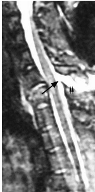
Fig 3. True-positive ligamentum flavum and interspinous ligament injuries. Sagittal STIR image demonstrates complete disruption of the ligamentum flavum (arrow) and interspinous ligament complex (paired small arrows) at C6–7, which was confirmed at surgery.