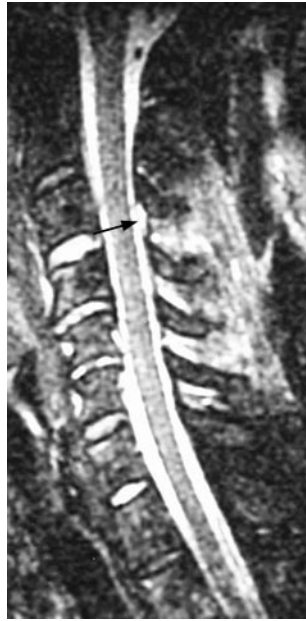
Fig 8. True-positive ligamentum flavum and false-positive interspinous soft tissues. Sagittal STIR image demonstrates disruption of the ligamentum flavum at multiple levels. Injury at the operative level C3–4 (arrow) was confirmed at surgery. On the image, there is also increased T2 signal intensity with stretching of the interspinous ligamentous complex; however, at surgery, this complex was intact.