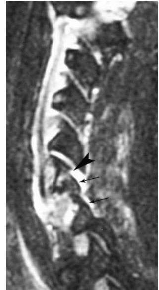
Fig 4. True-positive facet fracture-dislocation. Parasagittal fast spin-echo T2 image shows a C6 facet fracture (arrowhead) with C6–7 facet dislocation (arrows), which were confirmed at surgery.