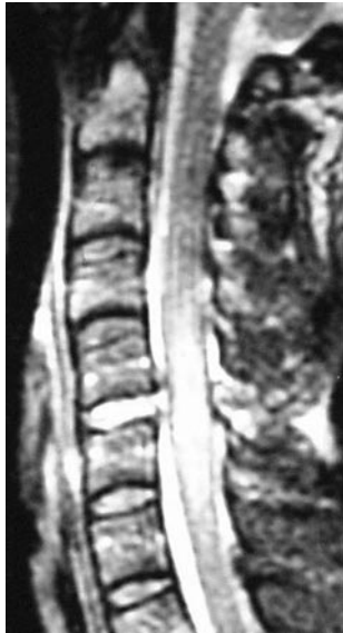
Fig 6. False-negative ALL. Sagittal fast spin-echo T2-weighted image demonstrates widening of the intervertebral disk and disruption of the PLL at C5–6, which were confirmed at surgery. The ALL, however, appears intact on the MR imaging but was found injured at surgery.