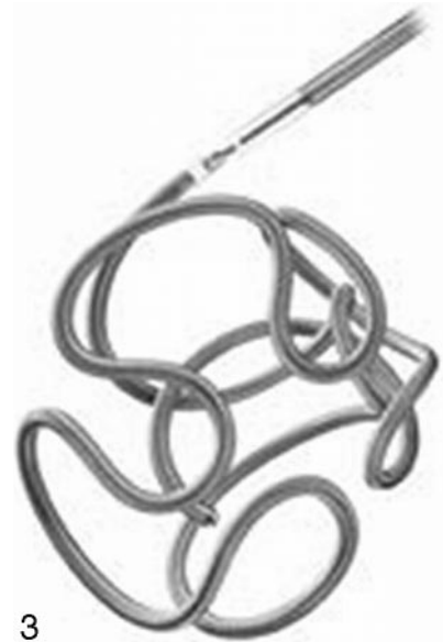
Fig. 3 GDC 10 3D coil.

tems, Best, the Netherlands) with the use of general anesthesia and systemic administration of heparin. Intravenously or subcutaneously administered heparin was continued for 48 hours after the procedure, followed by 80 mg of aspirin daily for 3 months. The aim of coiling was to pack the aneurysm as densely as possible, until not 1 more coil could be placed.