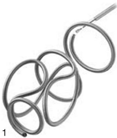
Fig 1. GDC 360° coil.