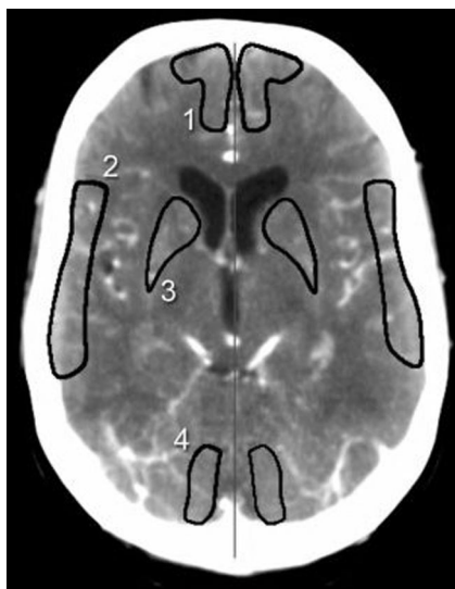
Fig 1. Analysis of manual outlined ROIs according to territorial division of Damasio. 26 1, ACA territory; 2, MCA territory; 3, basal ganglia; 4, PCA territory.