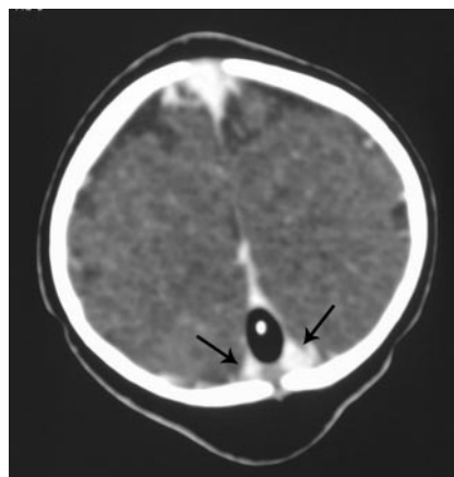
Fig 1. Contrast-enhanced CT shows subcutaneous lipoma and interparietal lipoma with central calcification. Note the duplication of sagittal sinus (arrows) and the defect in the parietal bone.

MR images revealed a posterior interhemispheric mass lesion, hyperintense on T1-weighted image (Fig 2) and hypointense on fat-suppressed T2-weighted image, consistent with lipoma. The lesion was extending to a subcutaneous lipoma through a defect in the parietal bones. Within the inferior part of the intracranial lipoma, a round mass, isointense on T1-weighted image and hyperintense on fat suppressed T2-weighted images, was present, which was thought to be parenchymal tissue. The mass located within the lipoma had a connection with the tectum stretching it posteriorly and superiorly