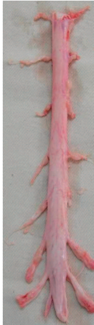
Fig 3. Animals were sacrificed 1 week after ozone (10 mL, 90 \mu\text{g/mL} ) injection into the subarachnoid space, and the spinal cord was obtained. The appearance of the spinal cords is normal. There is no discoloring or tarnishing, and the vessel is vivid and visible.

rather with repeated puncture. We speculate that the hyperemia is correlated with repeated sampling of CSF before animal sacrifice.