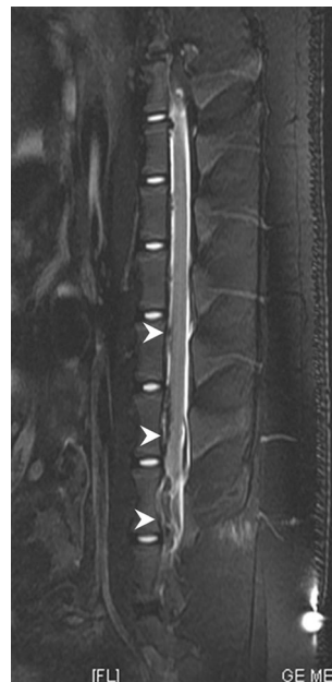
Fig 1. Sagittal FSE T2-weighted MR image (TR/TE, 4000/110 ms) scanned 30 minutes after ozone (10 mL, 90 \mu g/mL) injection into the subarachnoid space shows gas (white arrowheads) in the subarachnoid space. There are no signal intensity changes in the spinal cord.

The appearance of the spinal cords was grossly normal. There were no swelling, adhesion, discoloring, and tarnishing. The vessels of the dural sac were vivid and visible. The color and texture of nerve roots were normal in appearance (Fig 3).