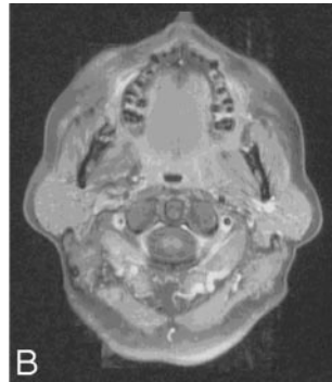
Fig 4. T1 pregadolinium (A) and postgadolinium (B) with fat saturation demonstrating a mass isointense to muscle in the left parapharyngeal fat with peripheral rim enhancement.

thirds of the ET. 2 On otoscopic examination, the tympanic membrane moves freely in and out with respiration, enhanced by obstructing a nostril. Patients often have a hyponasal voice from subconsciously trying to close the ET by closing their