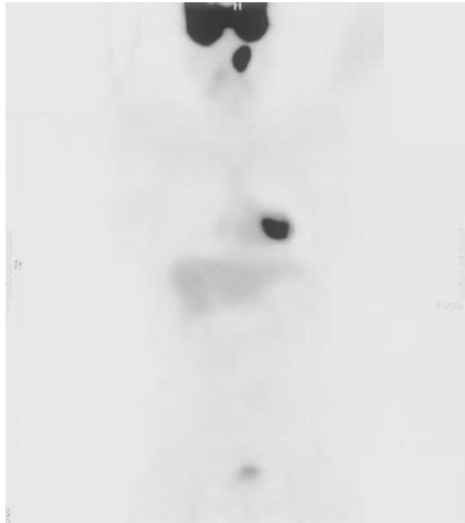
Fig 2. PET-CT with 2-cm hypermetabolic mass in the left skull base.